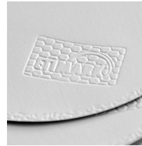
Elements of a brand which are accentuated by a 3-D-effect embossing